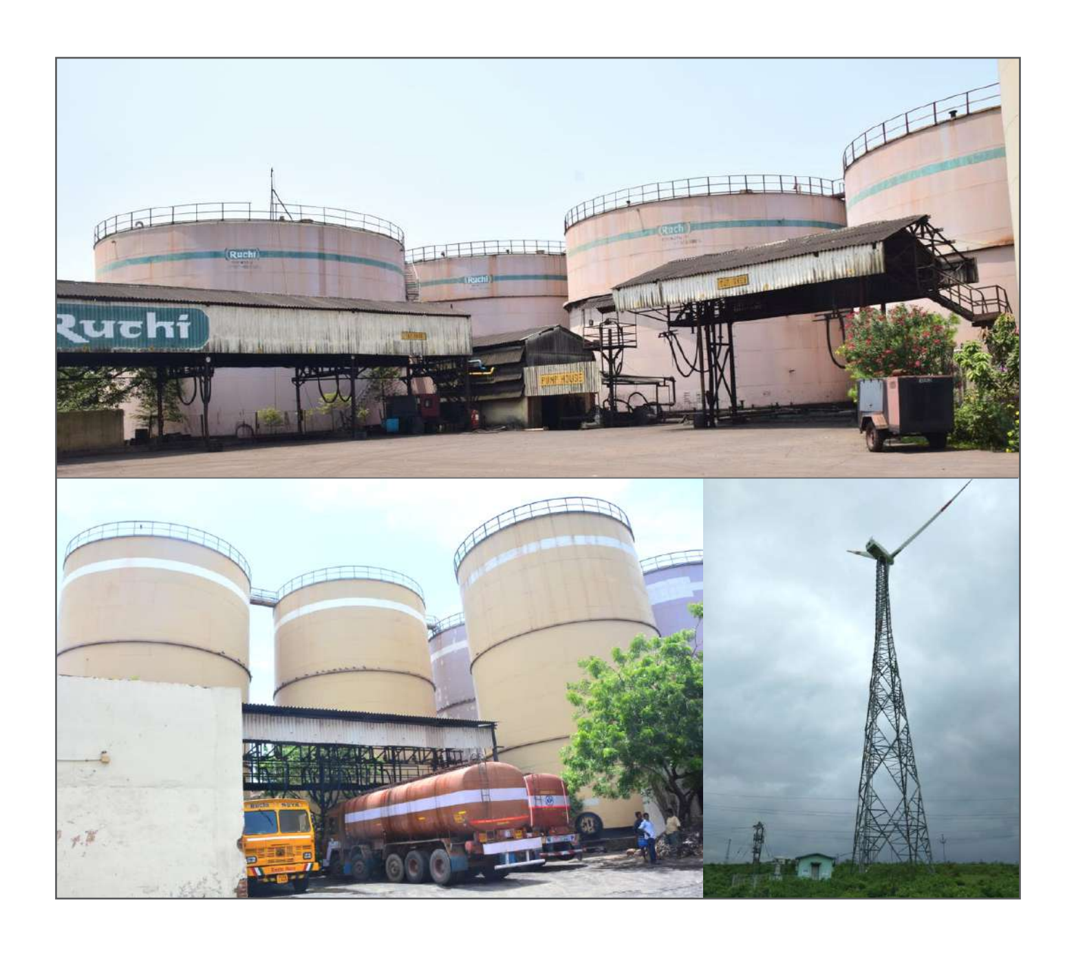
36th Annual Report 2019-20