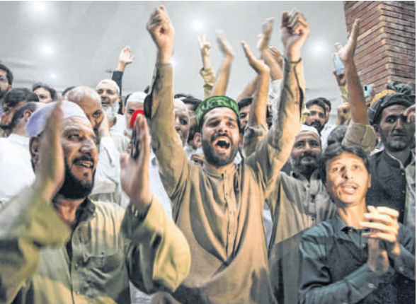
Supporters of newly elected PM Shabbaz Sharif celebrate outside their party office in Peshawar on Monday.

Sources said Shehbaz would formulate guidelines.